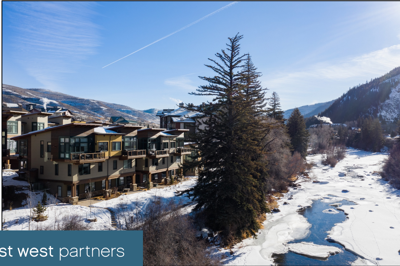
Riverfront Village, Avon